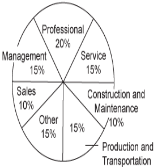
Percent Distribution of Workforce by Employment Sector